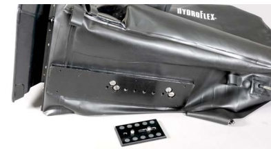
RBQ plate on Studio bag

In the studio style bag, the camera mounts on a standard ARRI style bridge plate and slides fore and aft on a sliding dovetail plate to accommodate different length lenses.