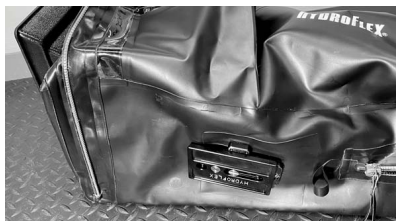
RBQ Plate on Hand Held bag